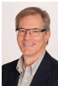
LR Enterprises Management, LLC