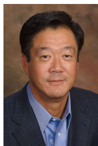
Former Corporate Vice President, Microsoft Corporation