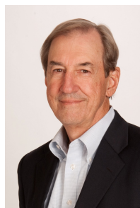
Former Chief Operating Officer, Nextel Corporation