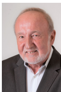
Executive Chairman and Interim Chief Executive Officer, GameStop Corp.