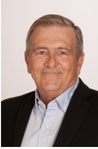
Former Chairman, Gadzooks, Inc.