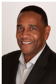
Executive Vice President & Chief Revenue Officer, Metropolitan Washington Airports Authority