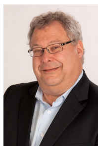
Chief Executive Officer, The Atlanta Hawks