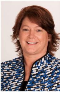
Senior Client Partner, Consumer Markets, Korn Ferry International