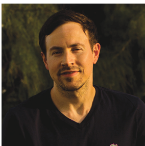
Founder and Former Chief Executive Officer, Chewy, Inc.