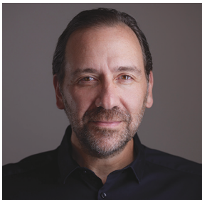
Former Chief Marketing Officer, Chewy Inc.