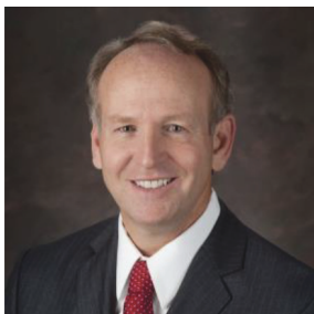
Chief Executive Officer, GameStop Corp.