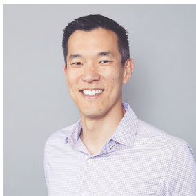
Co-Founder and Managing Partner, Volition Capital