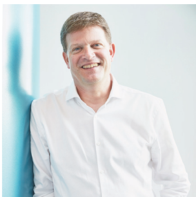
Former Chief Financial Officer, Chewy, Inc.