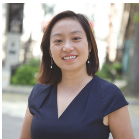
Senior Vice President of Global Finance and Treasury, The Kraft Heinz Company